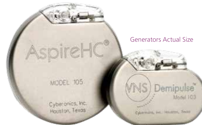
Generators Actual Size