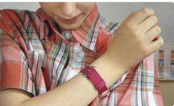
Magnet being applied to temporarily control side effects

These side effects generally occur only when the generator is on and usually decrease over time. You will be given a handheld magnet that can be used to temporarily control these side effects during activities such as public speaking, singing, or exercising if needed.